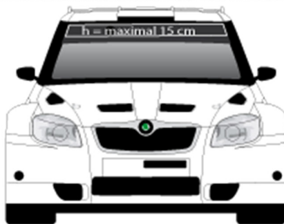
FRONTSCHIEBE LT. ARTIKEL 18.7.4 national